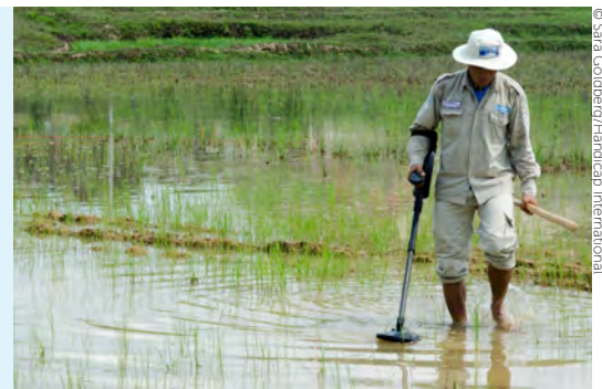
A Handicap International deminer in Laos.

Every year, thousands of people are killed or maimed by a landmine or cluster bomb. Our courageous deminers clear contaminated land in countries such as Lebanon and Laos, allowing children to play without the fear of an accident and communities to farm their land once more.