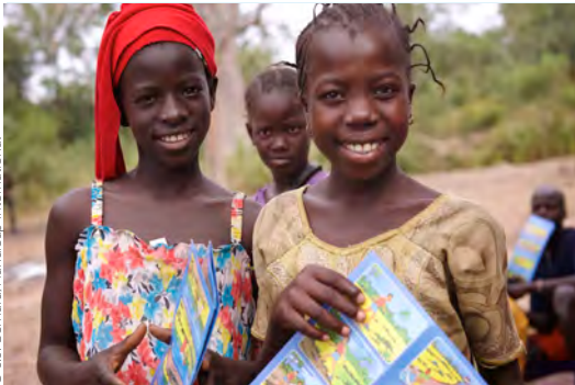
Children learning about the risks from weapons, Senegal.

Our teams visit schools, hospitals, and community centres to educate families about the danger from landmines and unexploded weapons. Children are especially at risk and we work to ensure they know what to do if they find a suspicious-looking object.